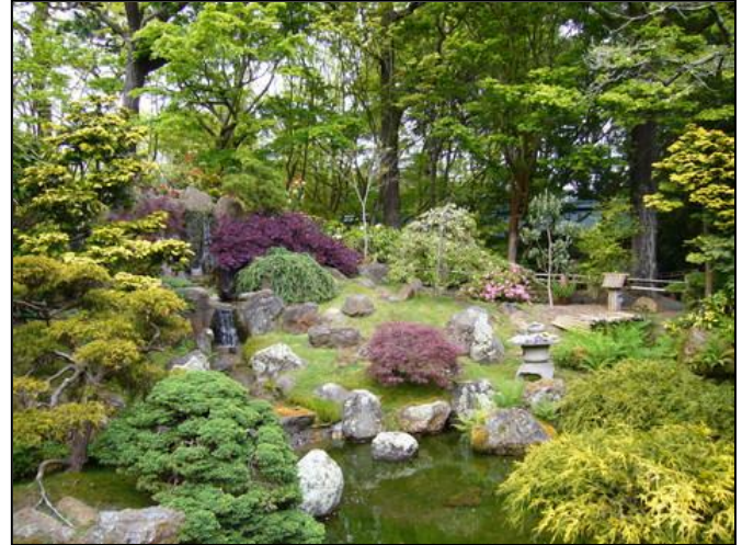
The Hale-YMCA Gardens in Blacksburg