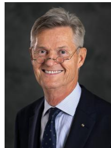
President 2020-21 Rotary Club of Herzogtum Lauenburg-Mölln, Germany