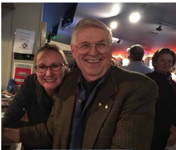
Pints for Polio - 2017