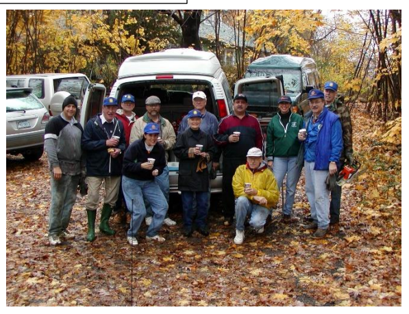
Wong Park work party, circa 2004.